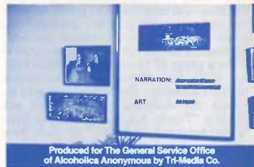
Design for frame to be used at opening of filmstrip "Markings on the Journey."

Staff report: Over 1,300 visitors toured G.S.O. in 1979; another 385 came on one day! The tour now encompasses all departments; many more archives items are available for viewing.