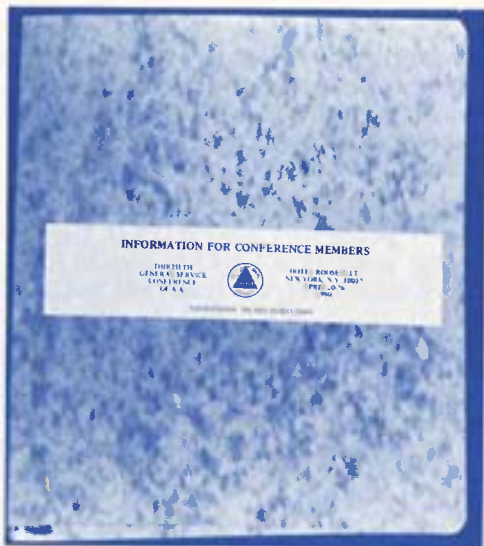
Familiar sight all through Conference week: the indispensable manual (orange-covered for 1980).