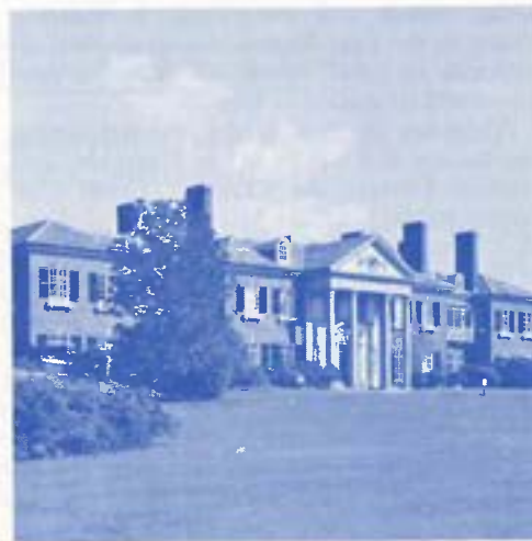
Site of 1980 World Service Meeting: Harrison Conference Center, Glen Cove, N.Y.